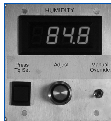
Humidity controller with continuous RH display and set point adjust.

NOTE: Options used in 5850xxH (winery humidification model) shown in bold . Specifications subject to change without notice.