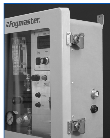
Control module features rainproof NEMA 4X enclosure, see-thru cover with lockable catches, environmental cable connectors.