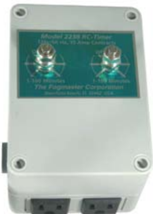
2238 REPEAT CYCLE TIMER

cycles (1-100 minutes each) are set with 1-turn knobs. Compatible with all foggers. International plugs and receptacles available. 120 VAC (P/N 223810); 240 VAC (P/N 223820)